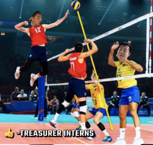
👍 -TREASURER INTERNS